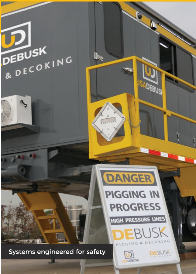
Systems engineered for safety